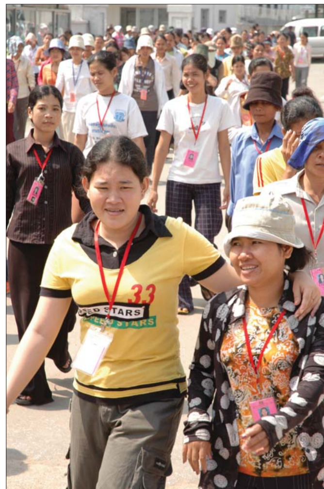
Outside the factory gates garment sector workers often have limited opportunities, but a new Better Factories competition aims to give them the opportunity to shine (see box, this page)