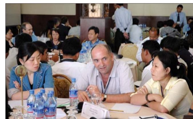
Participants at the Forum heard from buyers and other garment industry stakeholders.

The Buyers' Forum is held twice per year, and the next Forum is expected to be held in June/July 2007.