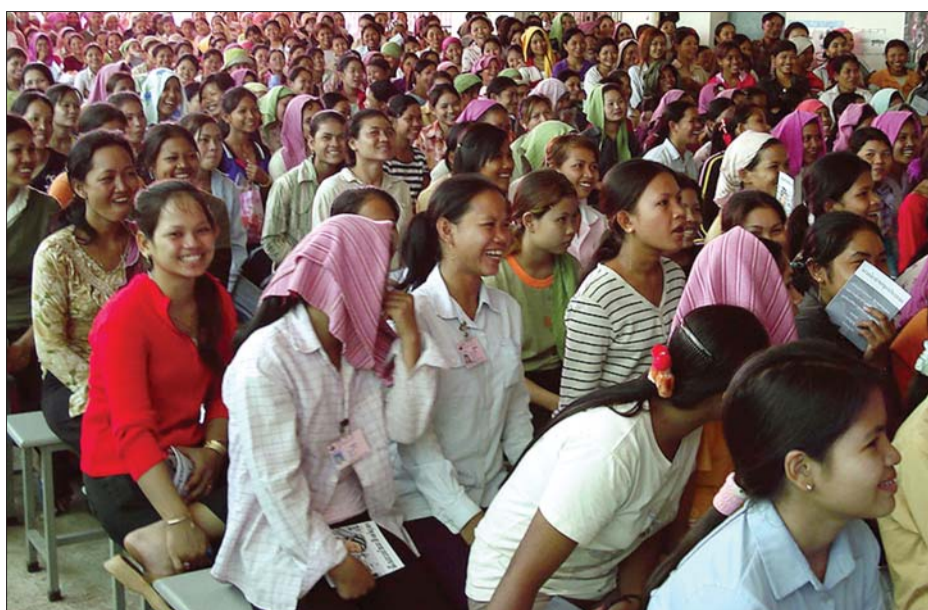
A full house viewing an episode of At the Factory Gates during lunch break.

The TV stars who appeared in Better Factories Cambodia's new soap opera series, At the Factory Gates recently praised the project and the series. Speaking during post-production, the stars and director of the series said that television is one of the most effective ways to teach and communicate with Cambodian people.