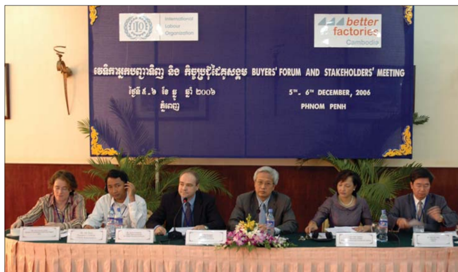
The 16 largest international buyers met with key garment industry stakeholders at the third Buyers' Forum in December.

The third Buyers' Forum was held in Phnom Penh on 5 December 2006. The Forum brings together key garment industry stakeholders, notably the 16 largest international garment brands who together purchase more than $1 billion worth of garment products from Cambodia each year.