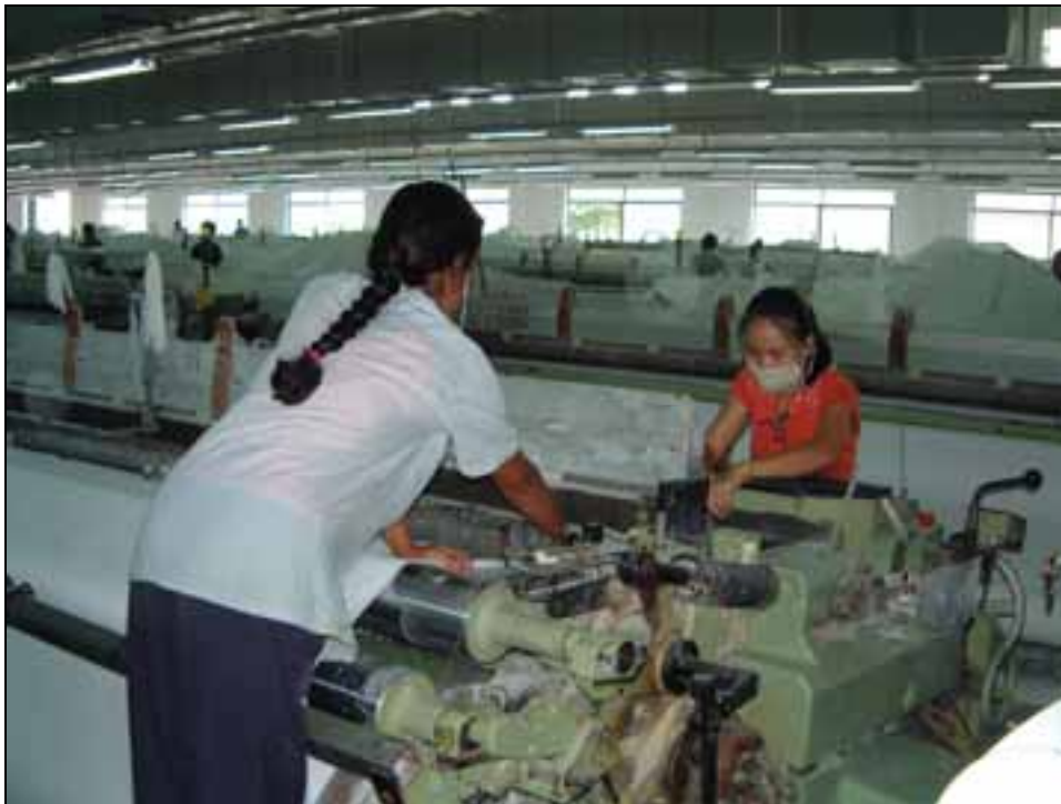
Picture 49: Workers are performing unsafe acts by leaning over poorly guarded machines (unsafe conditions). Look at the workers clothing, hair etc.

Here is an example of unsafe conditions and unsafe acts (see picture below).