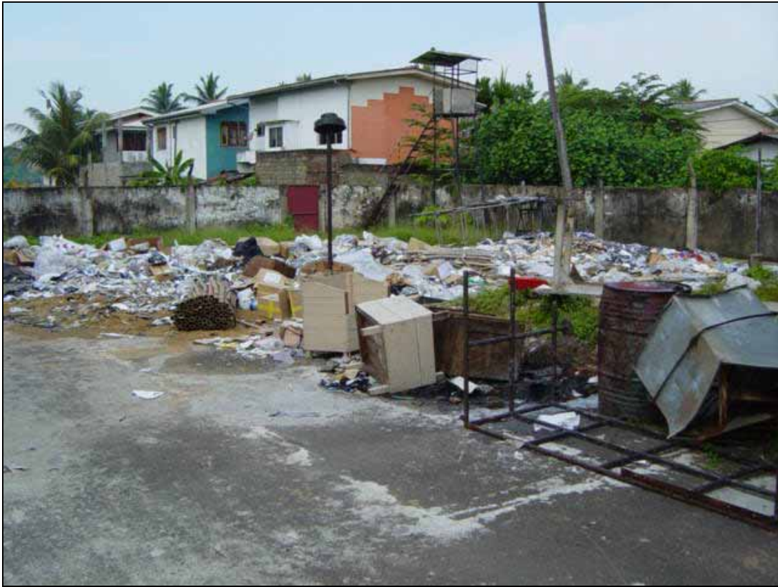
RPBT136 - sitemil kaksNI Edl ecj BbragcRkkatedrenH. sitemil pEdl enACMj .